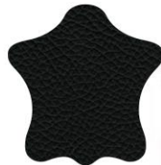
KAB Leather Black