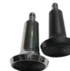
Pads; black or aluminium