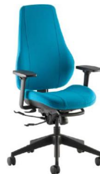
Step+ F26+ armrest