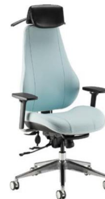
Step+ F37C + armrest (C= lumbar support) + coat hanger