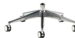
Aluminium (available also as black painted aluminium)