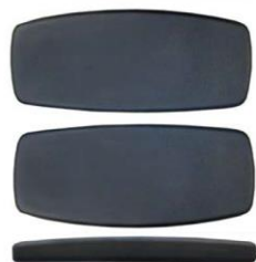
Asymmetrical shape from above and side