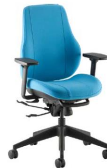
Step+ F23 + armrest