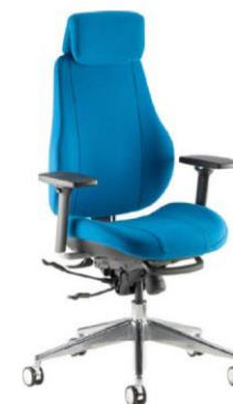
Step+ F24 + armrest