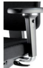
3D 360° ALU