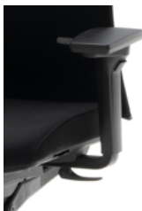
Idea soft 3D±20°