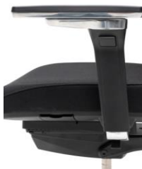
Idea XD ALU