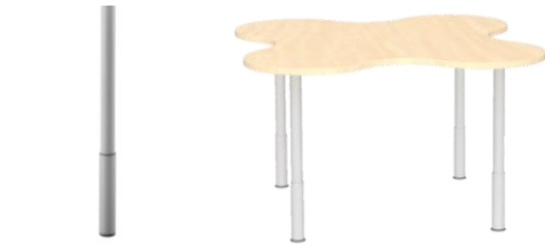
Matrix I Leg

The Cloud tabletop can be combined either with the Matrix I Leg or Summa Leg. Height options are: 710 mm / 730 mm / 830 mm.